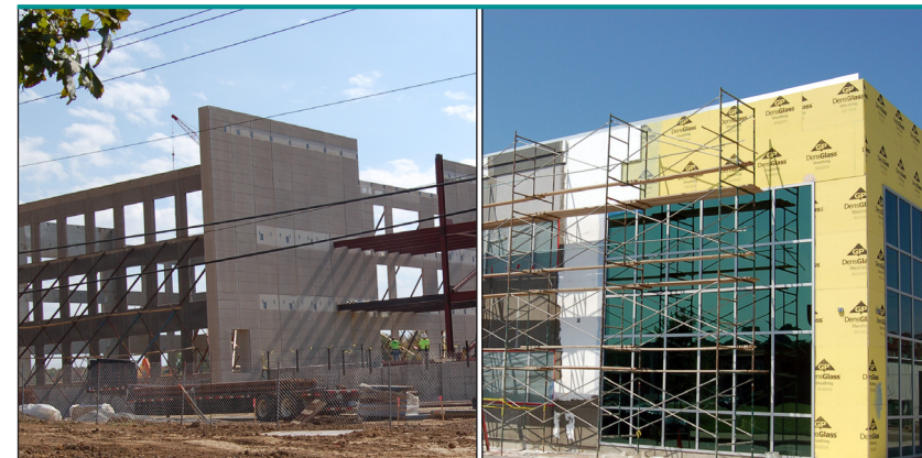
Boehringer Ingelheim Vetmedica, Inc. New Administrative Office Building