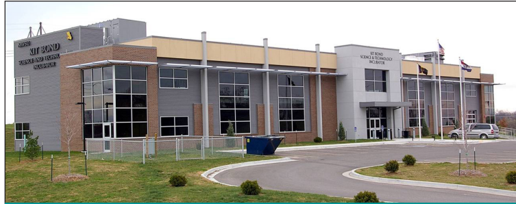
Christopher S. "Kit" Bond Science and Technology Incubator